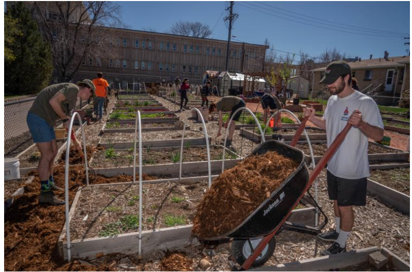
Figure 1 - Garden Planting

Especially because Earth Day is only a few weeks away.